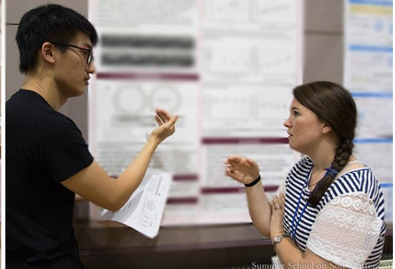
Poster sessions were held on July 30th and August 1st.

The intensive lectures continued on the Sapporo campus from the eighth day. On August 7<sup>th</sup> and 8<sup>th</sup>, participants joined the "Hokkaido University-ImPACT Joint Symposium," an international symposium on advanced soft matter held in coordination with the summer school. ImPACT is a governmental research program funded by the Japan Science and Technology Agency (JST). The participants were also given a campus tour to visit the university's cutting-edge facilities such as the Proton Beam Therapy Center and Isotope Imaging Laboratory.