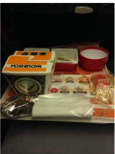
Fig 2. Movie and foods on an airplane.